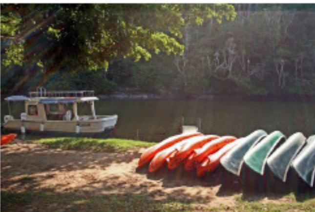
Areena Riverside Resort (Jikeleza Route)

Besides which, if they did ... what is there here for them