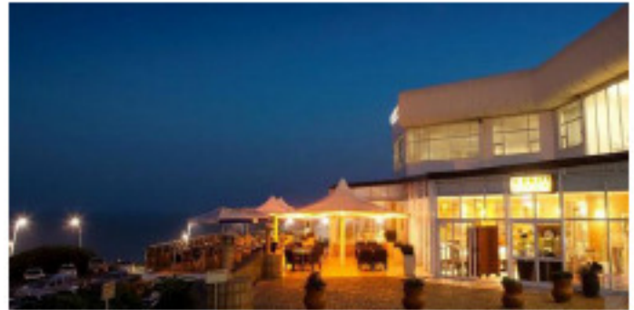
Grazia Fine Food & Wine – The Esplanade

Full of heathens ... with no appreciation of the arts!