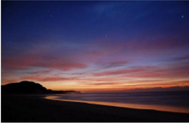
Nahoon Early Sunrise – Simon Comley

Some people believe that East London is a beautiful place