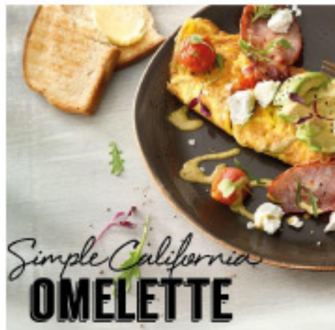
Simple California OMELETTE