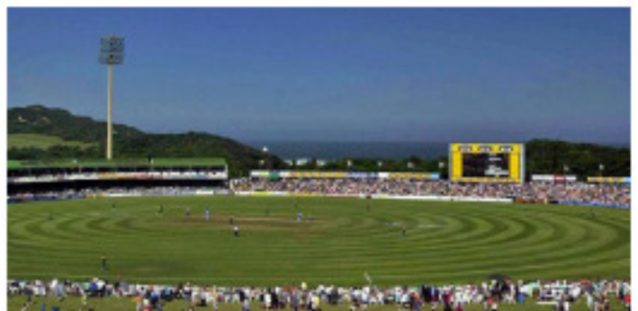
Buffalo Park Cricket Grounds

There is literally nowhere to watch sport