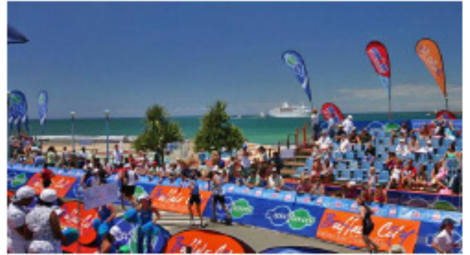
Half Iron Man – Harewood Lodge

They make ridiculous claims about it being the Adventure Capital of South Africa