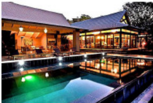
Prana Lodge – Chintsa East

And the Spa's are hardly about to win any 'World Luxury Awards'