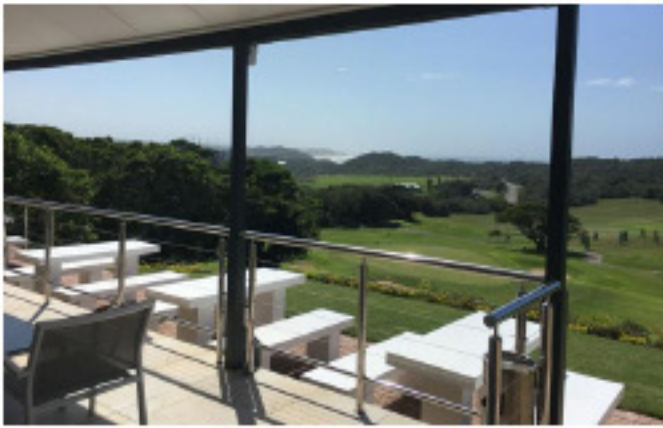
East London Golf Club – Sandy Loppnow