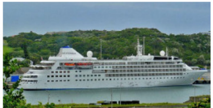
Cruise Liner 'Silver Wind' in EL Harbour

Besides which, if they did ... what is there here for them