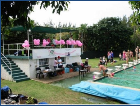
Northlands Primary School