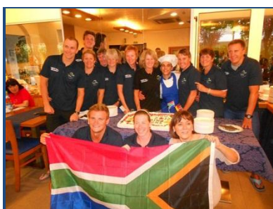
Farewell at Hotel